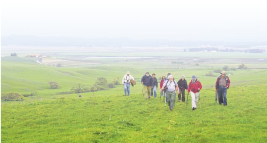
A sunset wildflower hike at Tolay Creek Ranch brought out hikers eager to stretch their legs after a long workday.