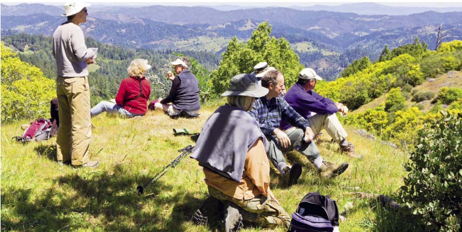
Sonoma Land Trust members were treated to a hike on the Lone Antler Trail at Little Black Mountain Preserve, which culminated in endless panoramic views on this clear spring day.