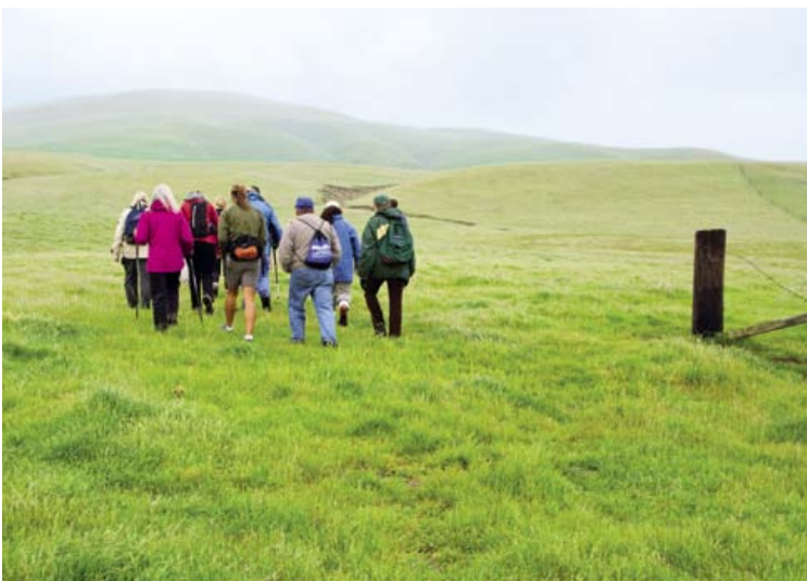
These hardy hikers braved an early evening rainstorm before setting off in search of the wildflower fields on Cougar Mountain.