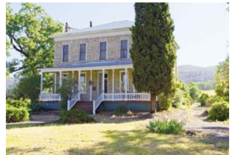
Glen Oaks Ranch in the Sonoma Valley.

In 2000, the Sonoma Land Trust formed the Legacy League to honor the commitment of people who make gifts in their estate plan or will. Even if you wish to remain anonymous, we encourage you to notify us about your intended planned gift so that we may enroll you in the Legacy League. You will be invited to the annual League event (usually held in October) and, unless you wish to remain anonymous, we will recognize you in our annual report.