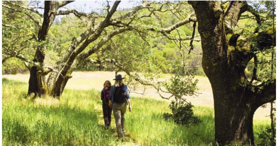
Hikers have their choice of meandering along Stuart Creek on the Phyllis Ellman Trail or rambling through oak and riparian woodlands leading up to chaparral habitat on the George Ellman Trail (pictured here).