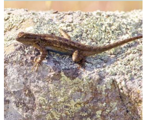
Western fence lizards are abundant at Glen Oaks and protect against Lyme disease in a unique way. When ticks carrying Lyme feed on the lizards, the Lyme bacteria die.