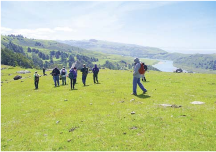
Our coastal jewel, the Jenner Headlands, draws hikers from all over the county and beyond who want to enjoy the dazzling views and breathe in the crisp sea air.