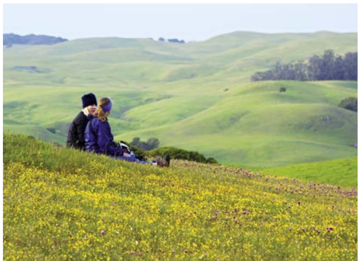
Taking some quiet time on Tolay Creek Ranch.