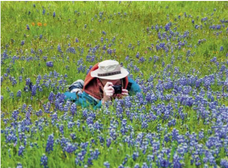
It's all about communing with the flowers — and getting the perfect shot! — on our Baylands wildflower hikes.