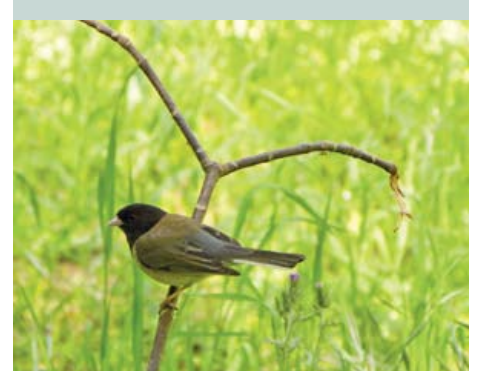
A dark-eyed junco eyes hikers along the woodland trail at Glen Oaks Ranch.